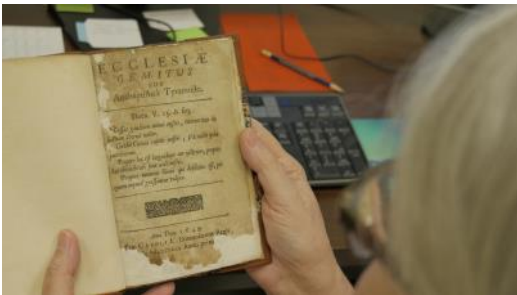
Some of our newly-catalogued books are found nowhere else in the world.

American Baptist Historical Society membership circles are named for some of our significant Baptist forebears. Look for a profile of Samuel Colgate in the next Primary Source .