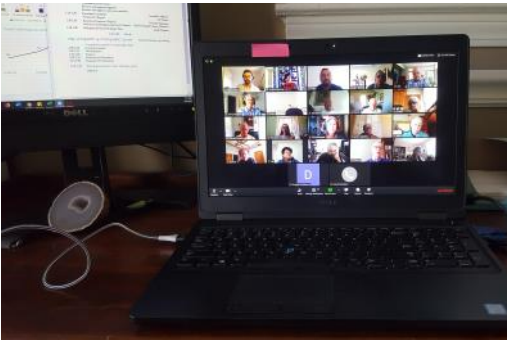
The ABHS Board of Managers met virtually, spring and fall.