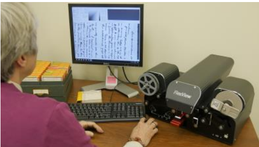
Digitizing microfilm is time-consuming, but renders an electronically-accessible copy.