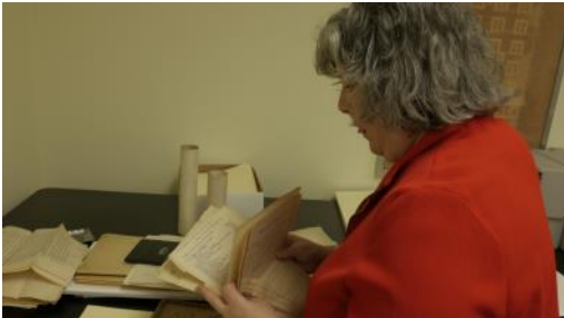
Being secluded at home meant many people had time to sort through attics and basements for records to send to ABHS!