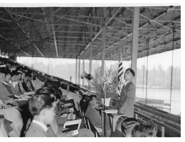
hip service at Japanese Assembly Camp in Santa Anita, CA Photograph, Signal Corps, United States Army (RG 1051 ph01)

Internees, or "colonists," as they preferred to be called, included Baptist pastors and graduates of divinity schools and the Baptist Missionary Training School. Along with home missionaries and foreign missionaries who were re-appointed after returning to the U.S. before the outbreak of war, they ministered inside of the relocation centers. The Home Mission Societies also assisted people in finding jobs and housing so they could move out of relocation centers to permanent communities in the interior of the country.