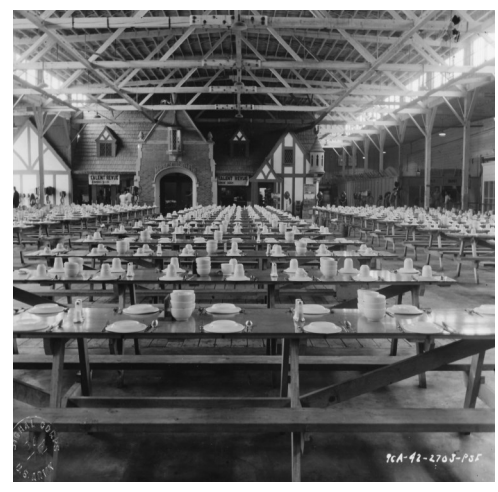
Mess Hall at Relocation Center Official U.S. Signal Corps Photo (RG 1051 ph03)

had to be scrutinized. You could write only what the government approved." (Missions, January, 1943, p.4)